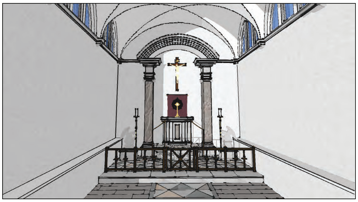
CHAPEL AT ST. LUKE THE EVANGELIST RALEIGH, NC